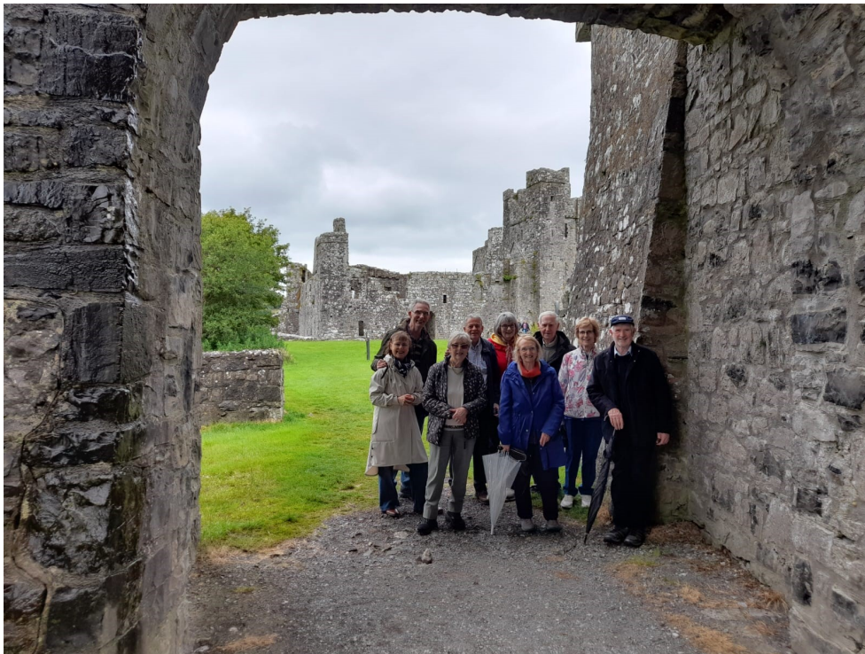
Summer Outing Mullingar at Fore Abbey