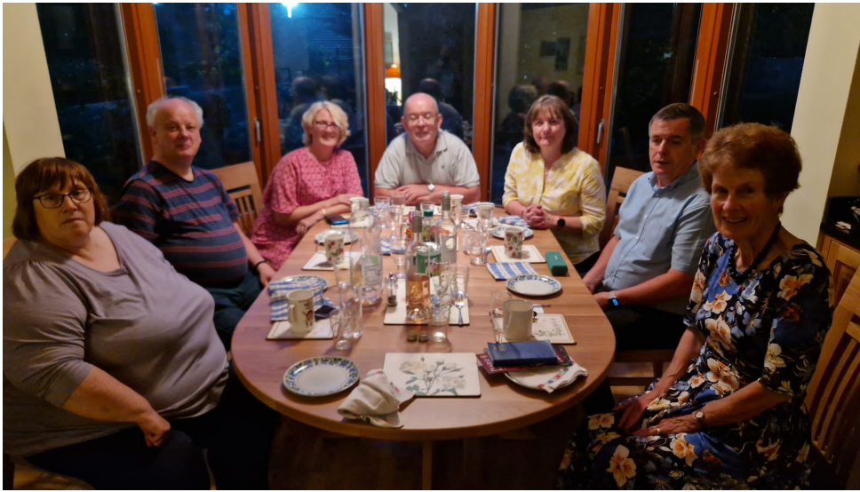
Dublin Sector Team get-together.