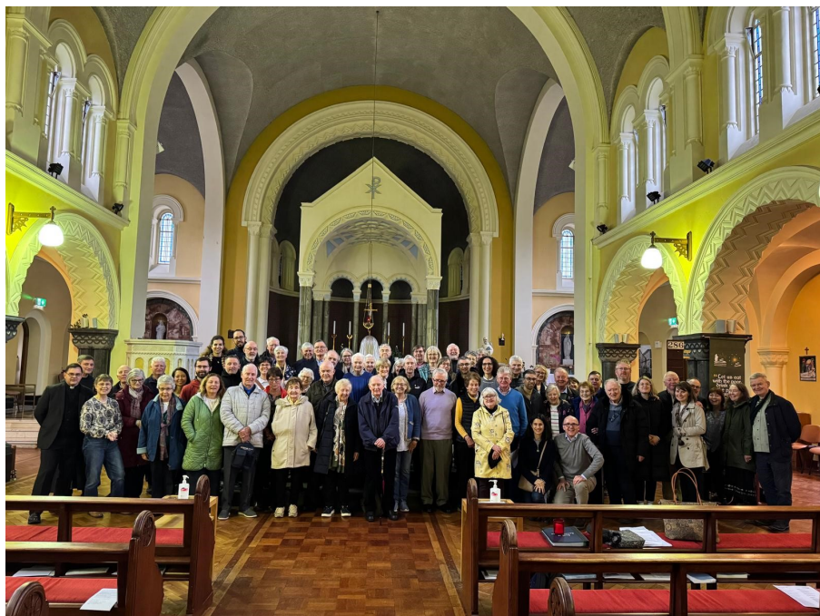
Photo taken after mass at retreat