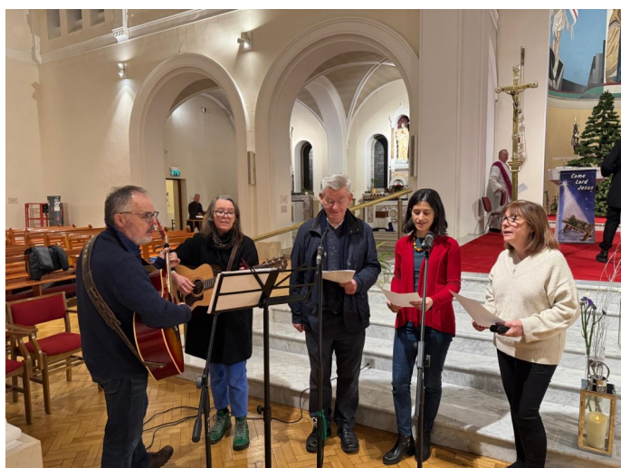
Members of the Teams Music Community at Mass on 7th December at St. Agnes Church, Crumlin.